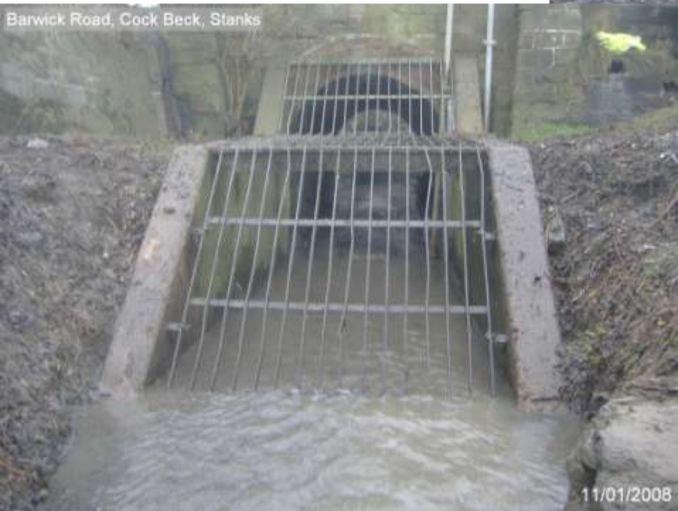
Barwick Road, Cock Beck, Stanks