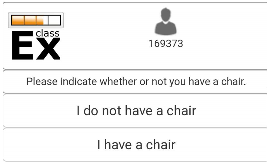
Figure 5: Participant Chair Selection Screen