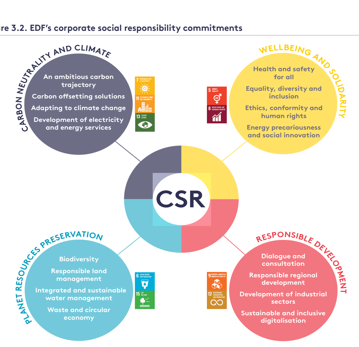
Figure 3.2. EDF's corporate social responsibility commitments

Note: The included SDGs are those defined as priorities in the World Business Council for Sustainable Development's report 'An SDD Roadmap for Electric Utilities'