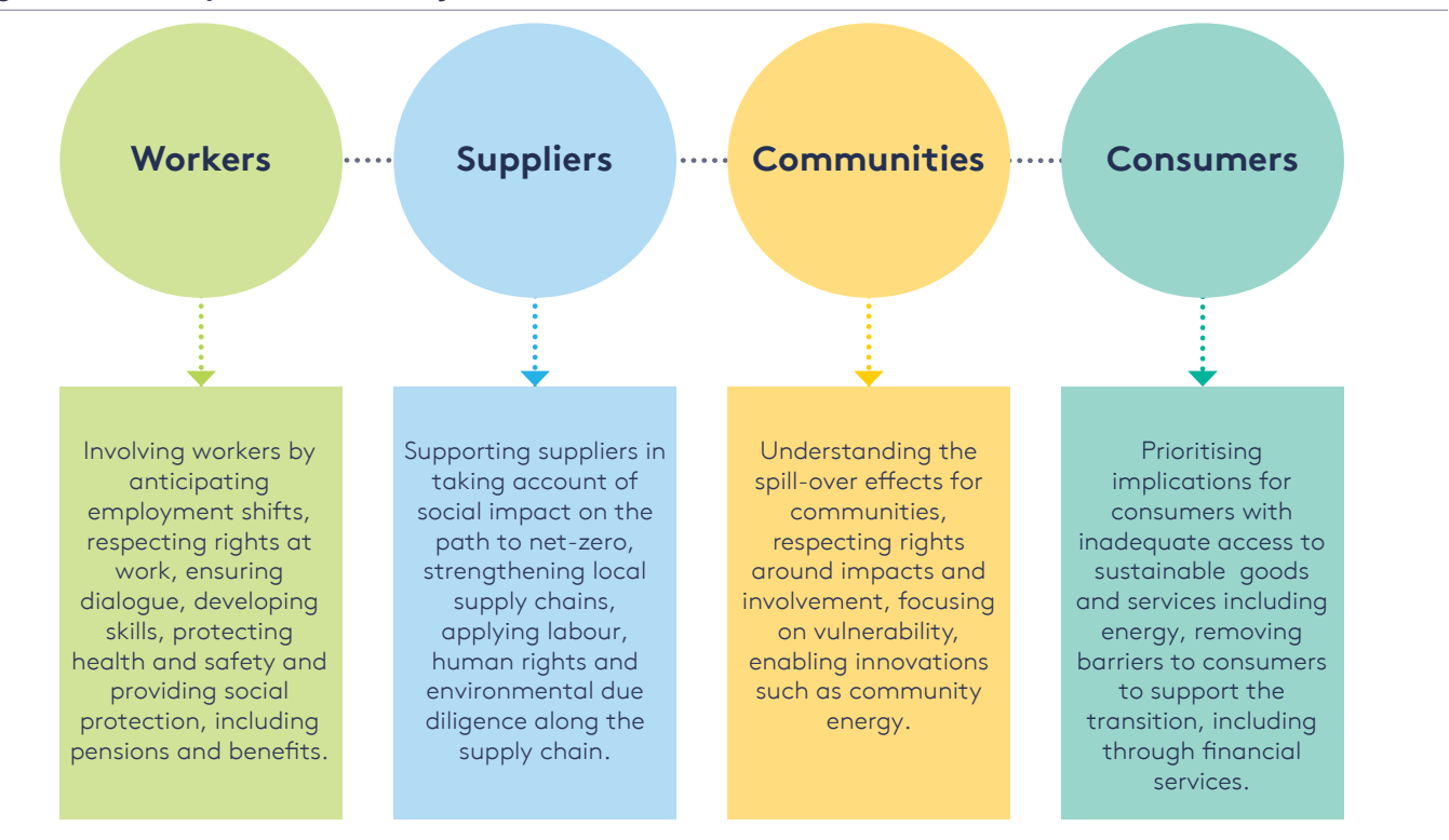
Figure 2.1. Components of the just transition