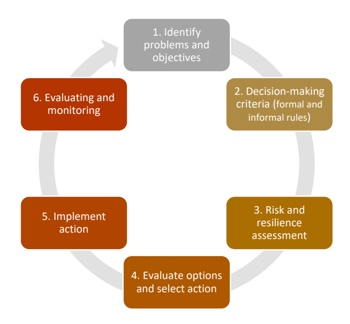
Figure 1. Different stages of the 'decision cycle' widely adopted for climate adaptation and disaster risk reduction decision-making studies – adopted from McDermott and Surminski (2018), IIASA & Zurich (2015), and CLIMATE-ADAPT Urban Adaptation Support Tool of the European Environment Agency, see <a href="https://climate-adapt.eea.europa.eu/knowledge/tools/urban-ast/step-0-0">https://climate-adapt.eea.europa.eu/knowledge/tools/urban-ast/step-0-0</a>.

As Surminski and Leck (2017) explain, in the context of urban climate decision-making, stages 1-3 are more focused on agenda-setting, planning, knowledge sharing and raising awareness, while stages 4-6 are aimed at implementing solutions and delivering actions. Transitioning from agenda setting to implementation is reported as the core of urban resilience discourse, where, after a period of evidence collection and analysis, actors are facing the challenge of implementing solutions (Surminski and Leck, 2017). McDermott and Surminski (2018) argue that even in cities with great access to accurate data on climate risk and resilience (stage 3), what often determines if and what action is taken is the normative interpretation of this information by urban decision-makers and their political judgements. This has led to growing interest in more innovating ways of supporting the implementation phase of the decision cycle for climate resilience.